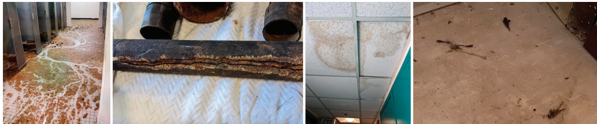
Sewage overflow in training barracks restroom.

Congress: Significant steps have been made to understand the scope of unaccompanied housing challenges. MOAA is asking Congress to require DoD to make unaccompanied housing installation conditions publicly available to support lawmaker oversight and sustain momentum to fix the $137 billion maintenance backlog.